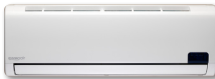
SZI Air Handler