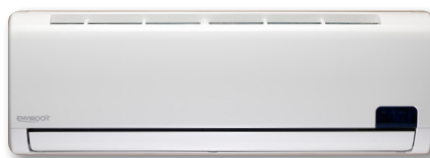
MZI Air Handler