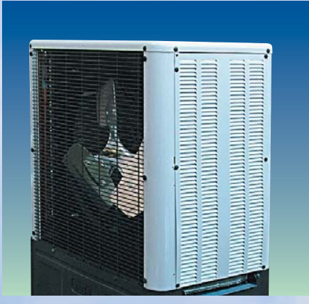
Hail Guard/Wind Baffle Accessory