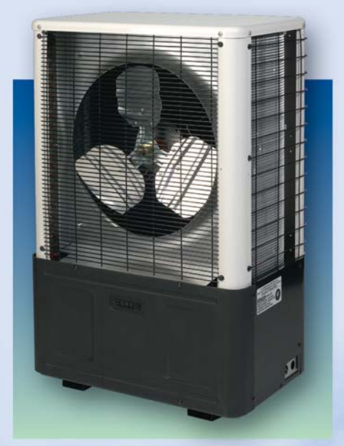
Side Discharge Condenser