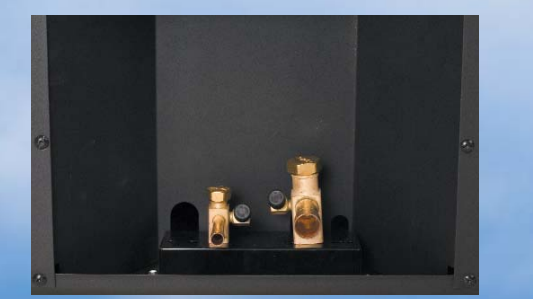
Service & Refrigerant Line Connections