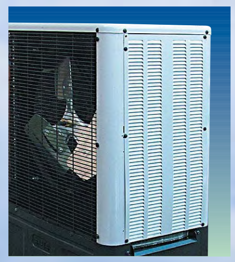
Hail Guard/Wind Baffle Accessory