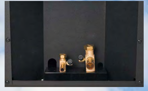
Service & Refrigerant Line Connections