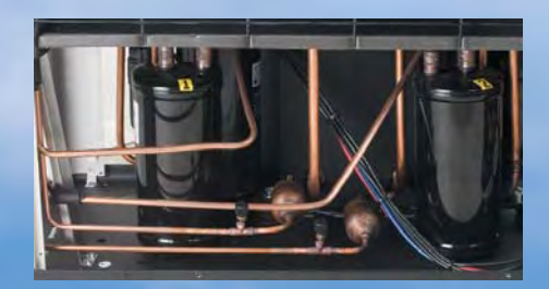
Independent Refrigerant Circuits