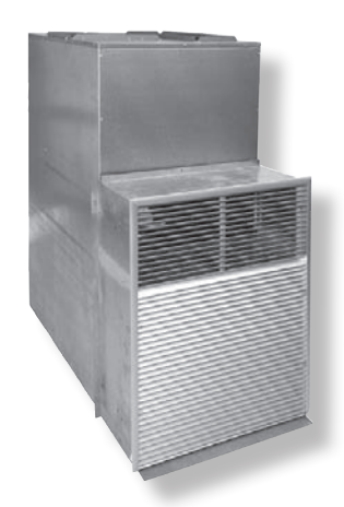
Nominal Cooling Capacity: 30,000 - 36,000 Btuh