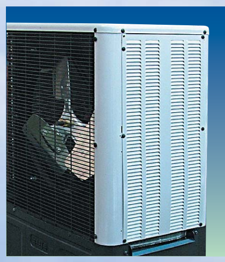
Hail Guard/Wind Baffle Accessory