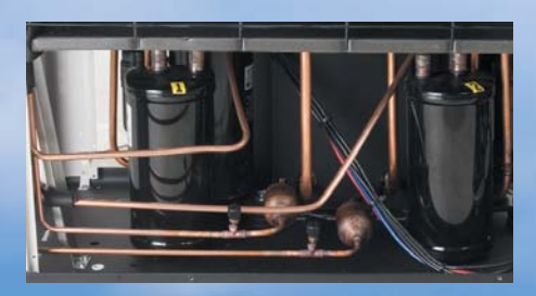
Independent Refrigerant Circuits