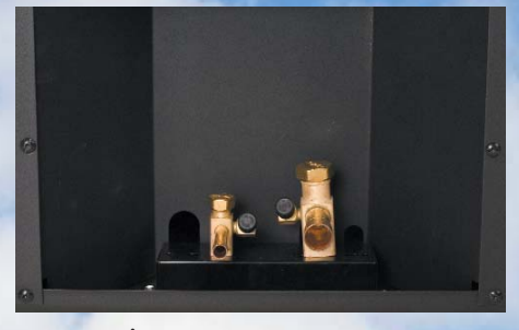
Service & Refrigerant Line Connections