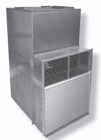
Nominal Cooling Capacity: 30,000 - 36,000 Btuh