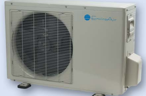
K1HA8000D00 18,000 Btuh (5.2 kW) Condenser

Installation accessories included with Tube Set